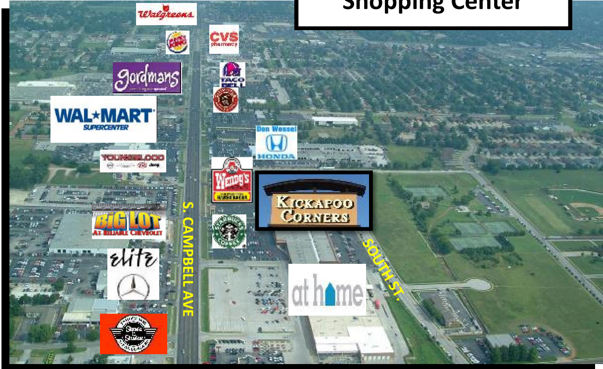
Kickapoo Corners View to the North